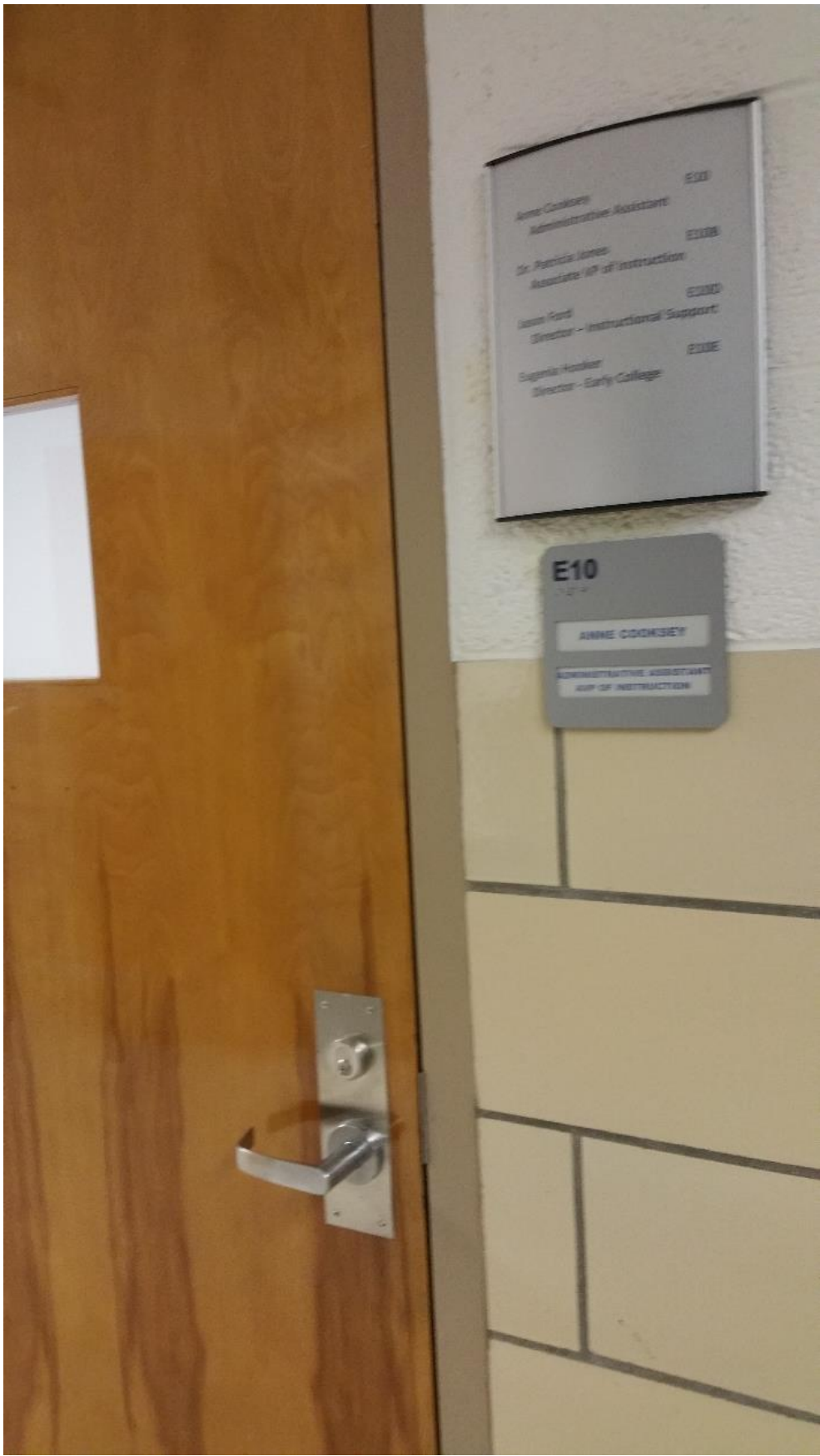
SLOTTED TYPE A