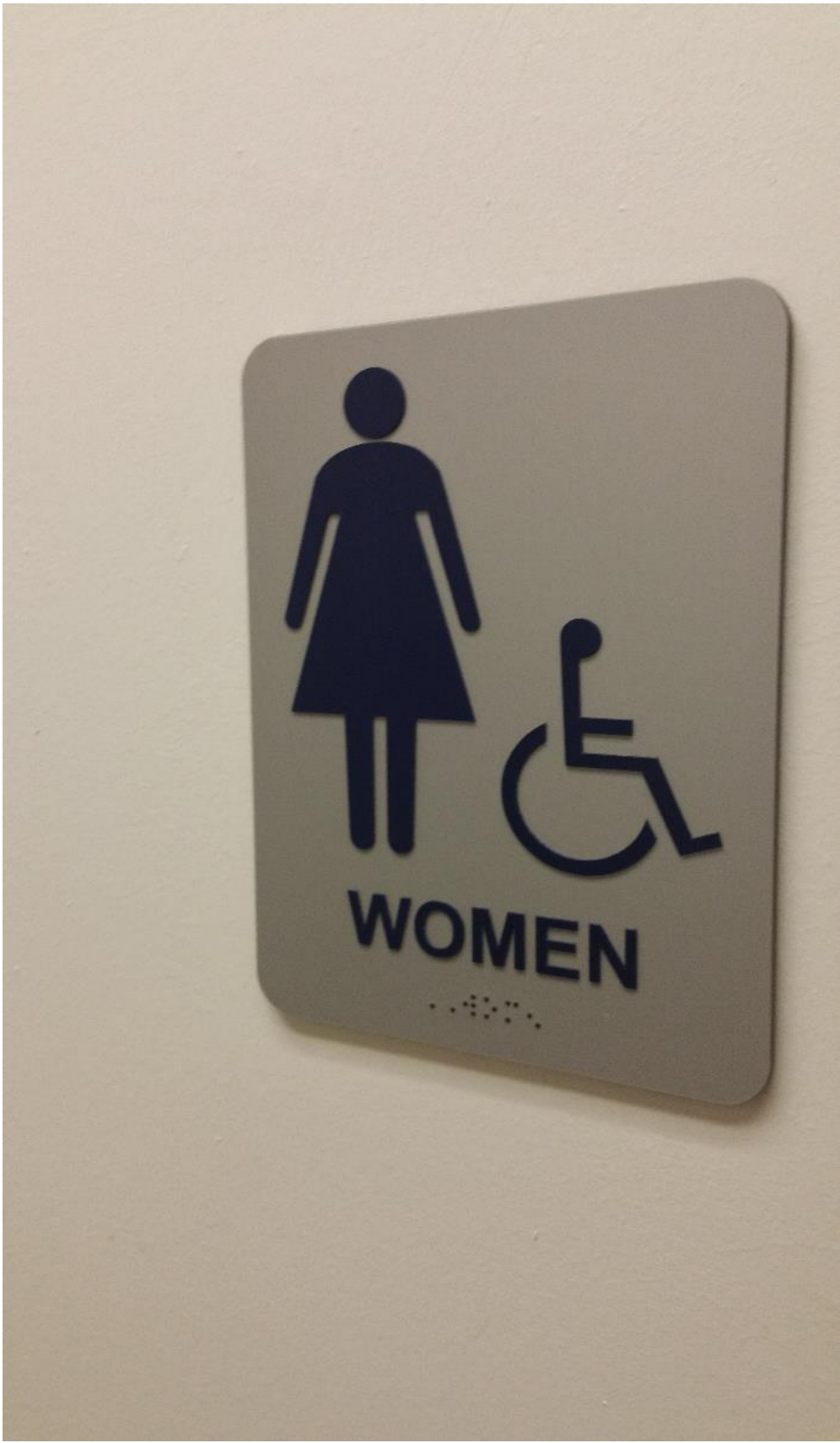
RESTROOM HC TYPE C