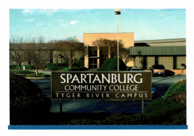
TYGER RIVER CAMPUS