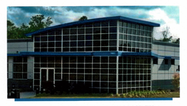
UNION COUNTY ADVANCED TECHNOLOGY CENTER