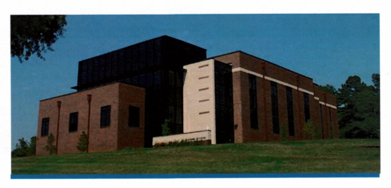
CHEROKEE COUNTY CAMPUS