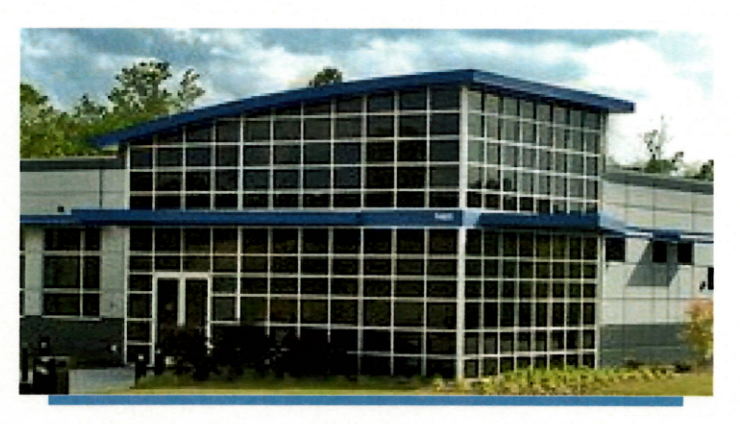
UNION COUNTY ADVANCED TECHNOLOGY CENTER